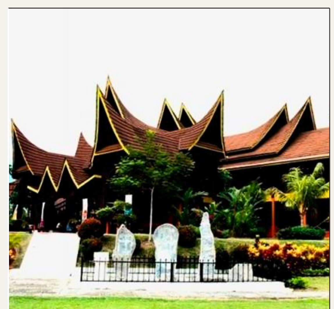
MUSEUM NEGERI SEMBILAN