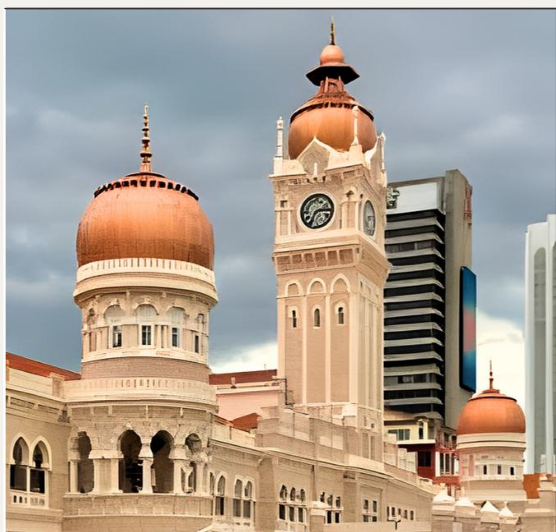
BANGUNAN SULTAN ABDUL SAMAD