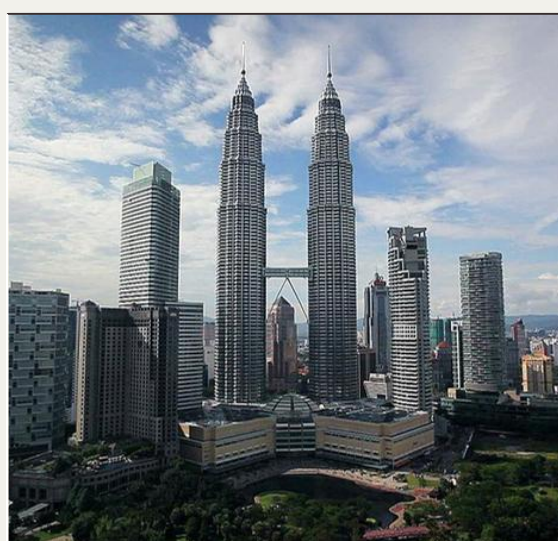
KUALA LUMPUR TWIN TOWER